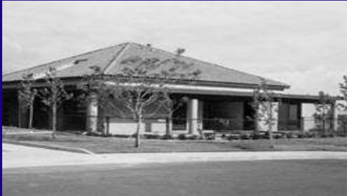
CPC Preschool, opened 1985